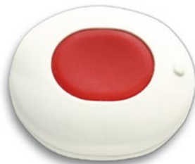
The Gem Home Alert pendant

You can reach help at any time with Home Alert simply by pressing the button on the specially designed light-weight pendant you wear or by pressing a button on the Home Alert communication unit which we will install in your home. When you press the button, the Home Alert communication unit will dial the monitoring centre.