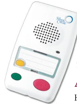
The T400 Home Alert contact unit

Calvary Silver Circle has chosen the most up to date technology available for Home Alert, sourced from Tunstall, a world leader in personal monitoring. Like Calvary Silver Circle, Tunstall specialises in supporting people at home. The Home Alert communication units are simple to use, robust and reliable and can be quickly installed at home.